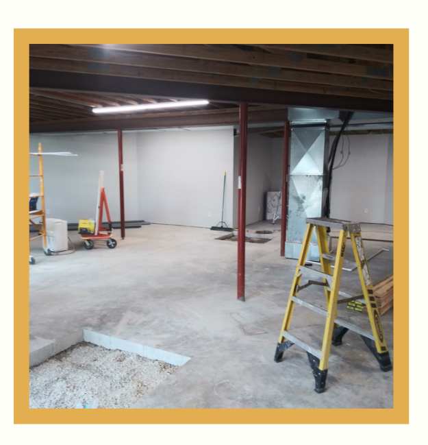
The furnace units have been moved and plumbing is being updated forr the teaching kitchen and additional bathroom.