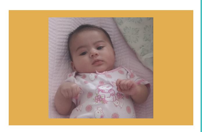
Our babies born in November 2022 are growing so quickly!

The high point for me was when we started to have Mass at our site. While we accept moms of all faiths and no faiths, we are influenced by our Catholic traditions. It is in the power of prayer and showing compassion that we are offering hope in a place of darkness for many of our moms. Their futures are brighter because of St. Mary's Home for Mothers.