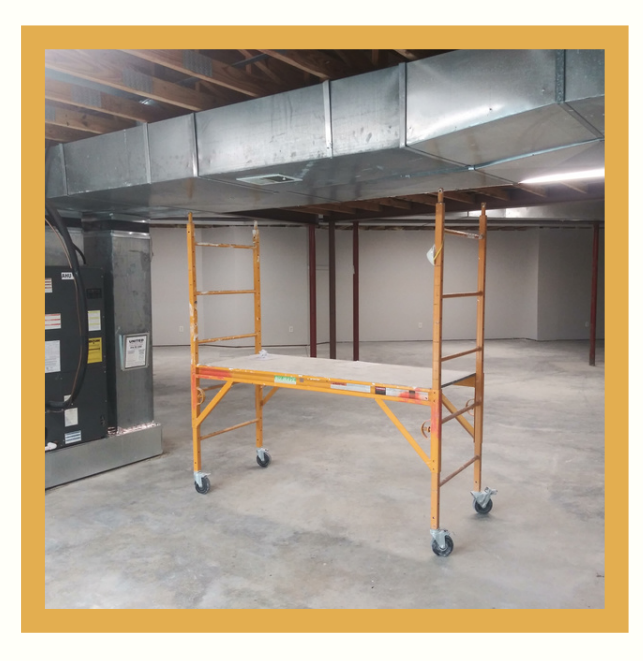
Construction has started on the basement. This picture shows furnace units before they were moved to make space for group therapy